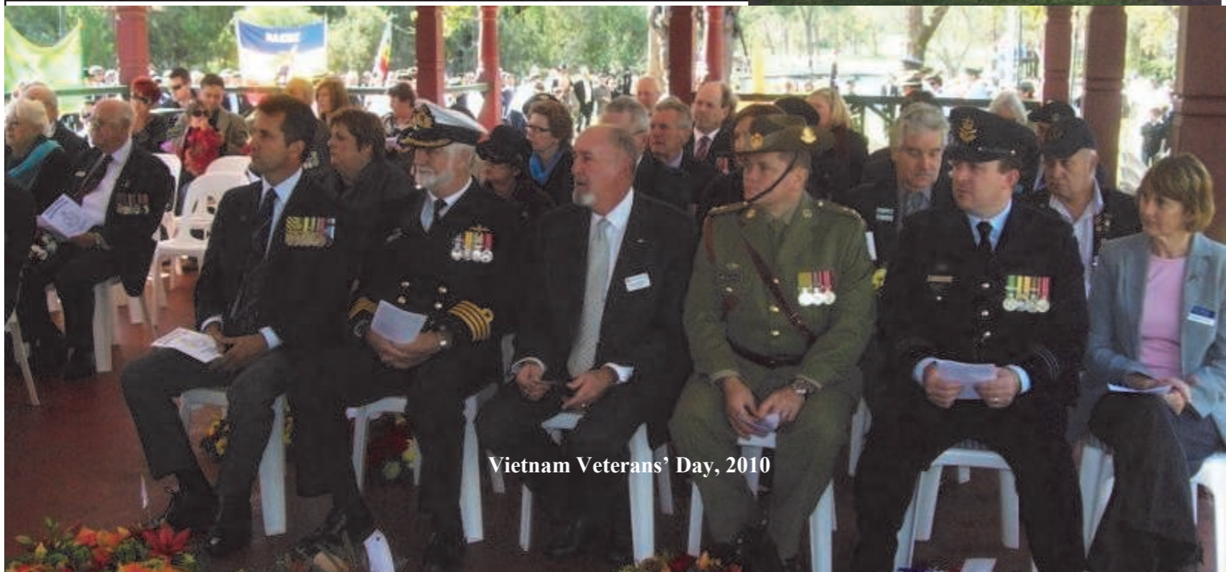
Vietnam Veterans' Day, 2010